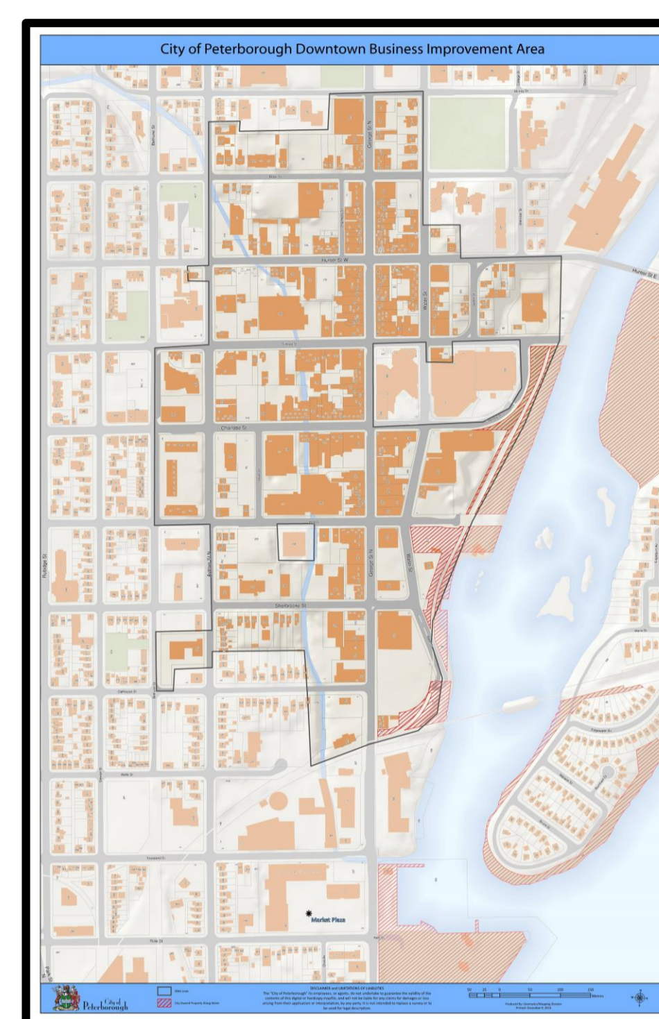
Figure 1: Map of DBIA