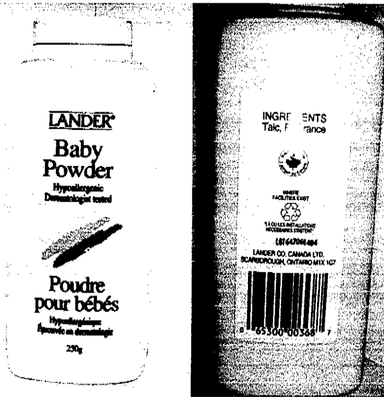
Figure 6.2 Lander's Baby Powder Image of baby powder found in my home that does not follow the Health Canada guidelines by having a precautionary label.

inhalation which can cause breathing problems.” (Health Canada). As you can see in Figure 6.2, there are no precautionary warnings to be found on this particular brand of baby powder, and it was even made in Canada! This is very unsettling because if standards are not always up held on baby products, I fear the situation may be even worse with other products, and many of the ingredients on The Cosmetic Ingredient “Hotlist” are a lot more dangerous than talc.