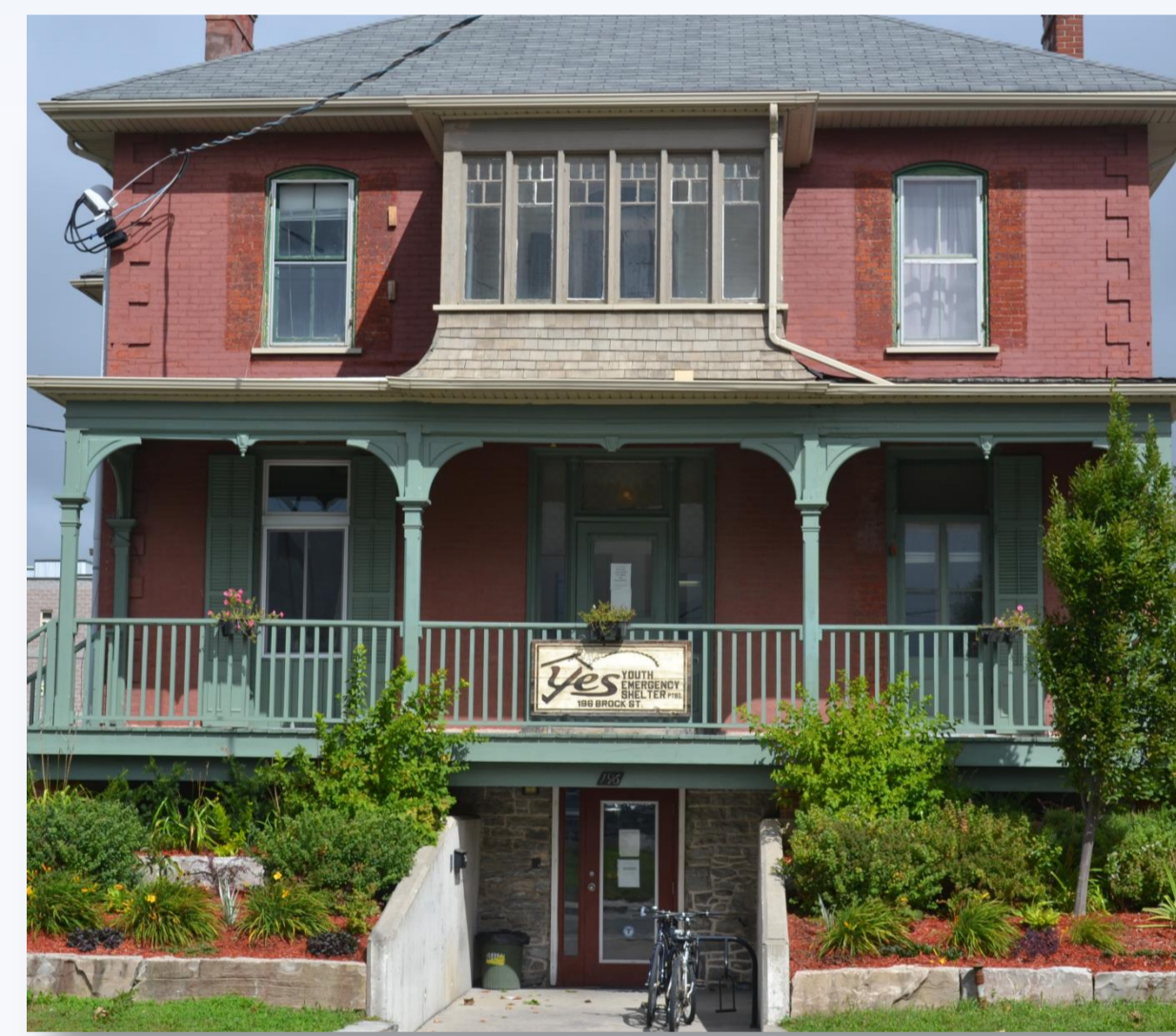
The YES Shelter for Youth and Families main building and emergency shelter

"They're still working on some of those life skills but they get a chance...they know they've got that support they're not totally on their own we're still here for whatever they need." – Jacky's Place.